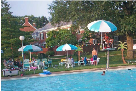
The Luau was just one of many pool events this summer designed to make the most of the hot weather and bring together members of our wonderful community!

Vandals continue to damage the sidewalk lights that run between South Stafford Street and Quaker Lane adjacent to the Fairlington Glen tennis courts. Repairs are extremely costly and, as I have mentioned in past issues, the Board has decided to replace these lights with durable