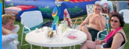
Photos of the Meadows annual Luau party. See more great pix on page 8!